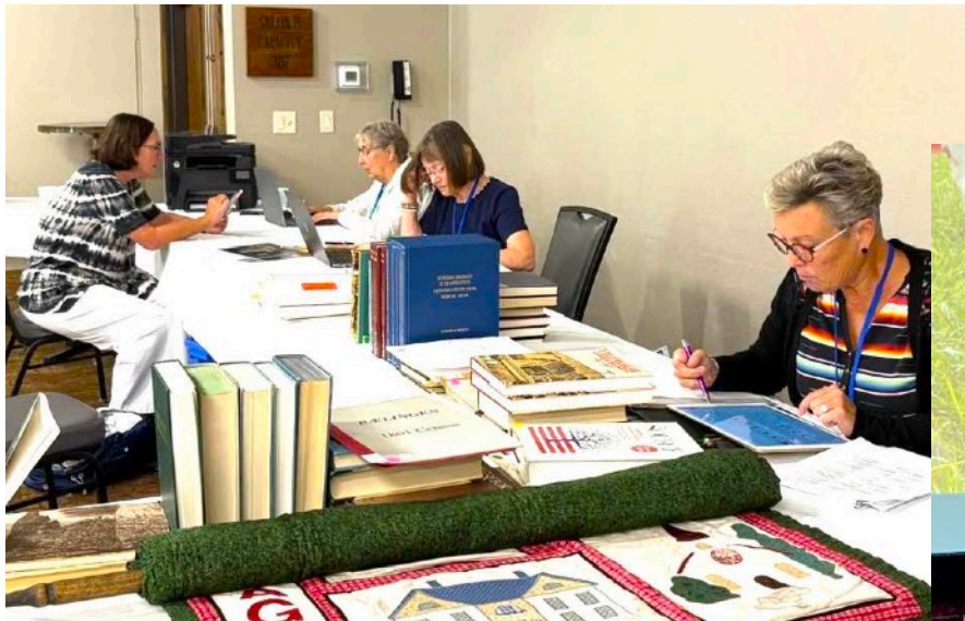
Romerikslaget research area in the Genealogy Lab.