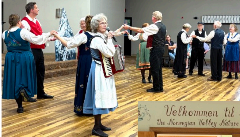
Wergeland Dancers, La Crosse Sons of Norway