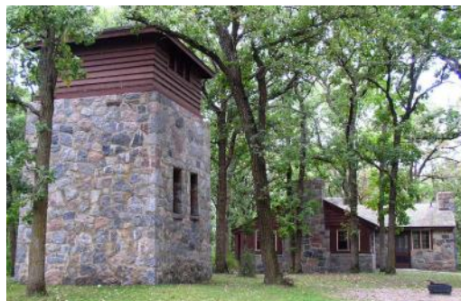
Sibley State Park