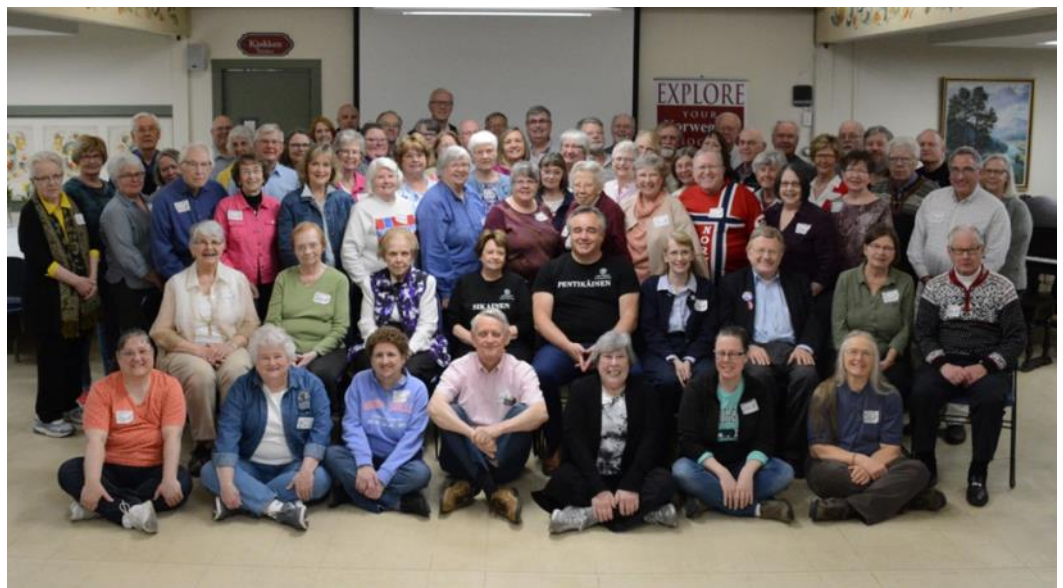
Fellesraad Annual Meeting May 2019

The influence of both organizations will be felt throughout the Norwegian and Norwegian-American genealogical and historical communities. Partnering builds visibility of both of our organizations in Norway and Norwegian-America. Together we can help each other find needed information. And, of course, we (Bygdelag) invite you to attend our Bygdelag Stevner, where you will be received like royalty!