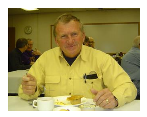
Lakes Country Water Resources