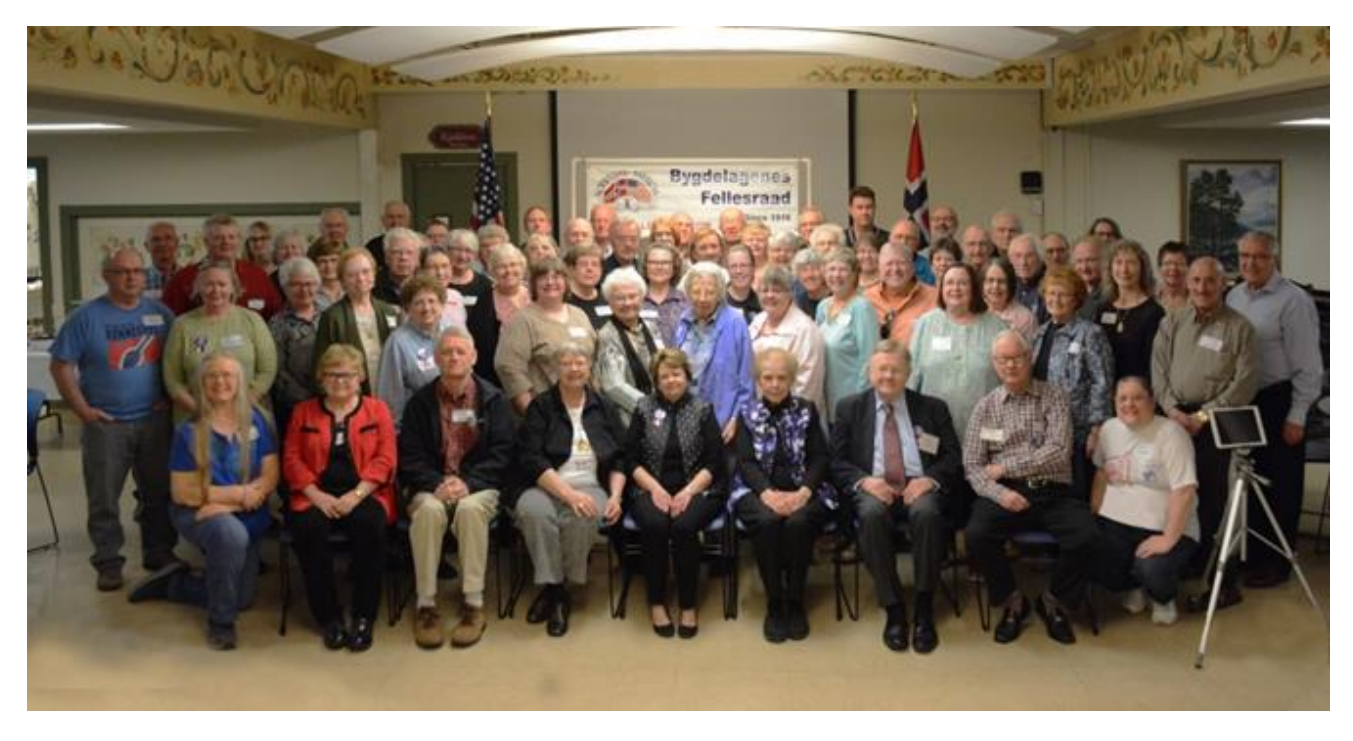
Bygdelagenes Fellesraad Annual Meeting May 5, 2018