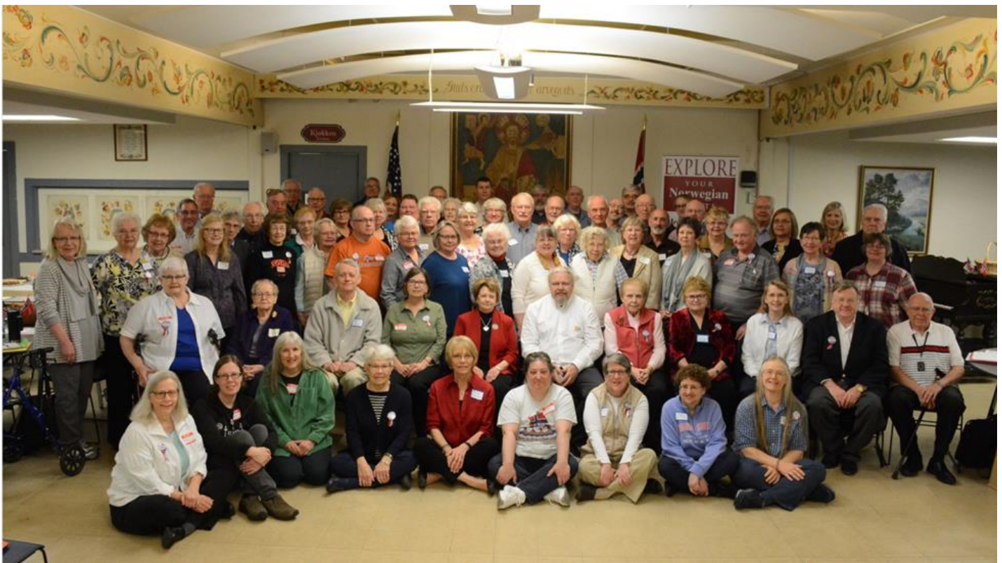
Fellesraad Annual Meeting May 2017 Norwegian-American Bygdelagenes Fellesraad is the national council for the twenty-nine (currently active) affiliated Norwegian-American Bygdelag.