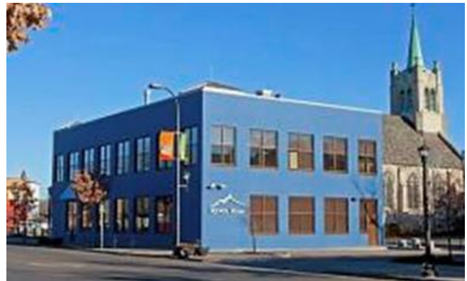
Norway House 913 East Franklin Avenue Minneapolis, MN